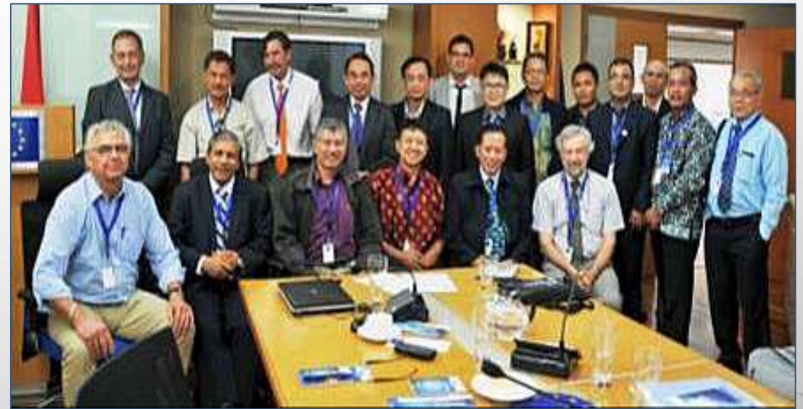
ASEAN-EU Meeting – EATiP participation - 2015