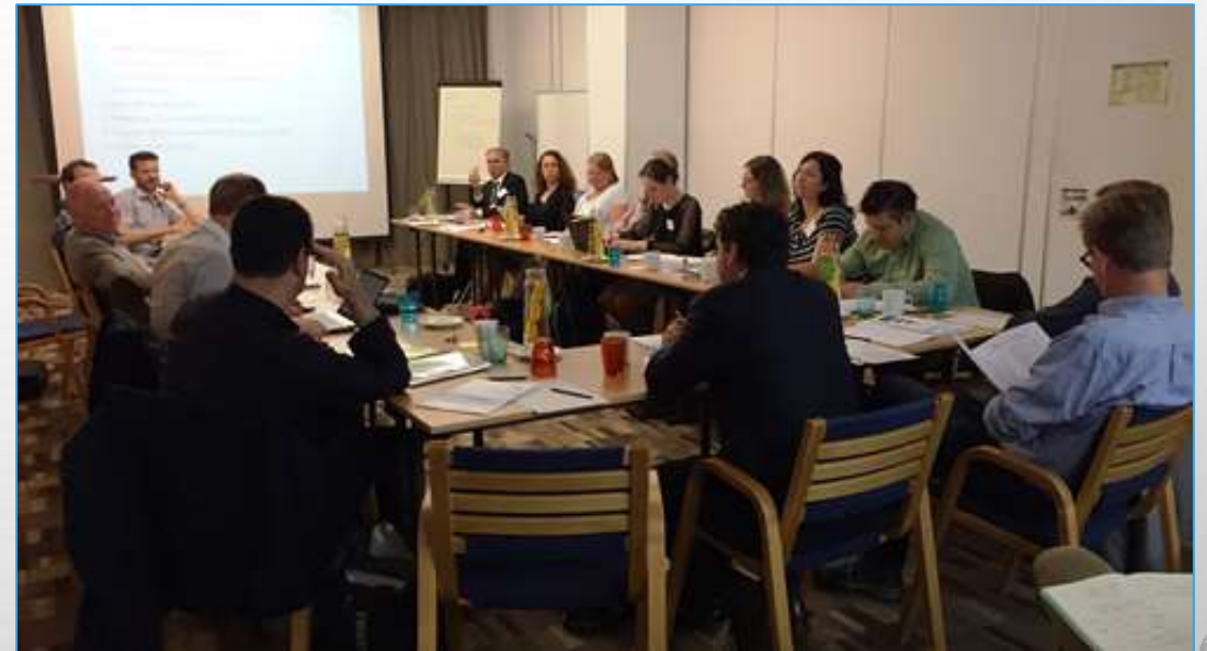
EATiP Mirror Platform Meeting - 2016

KEY FOR MOBILISATION OF SMES IN RESEARCH